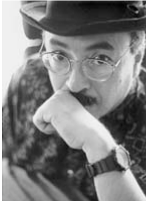
Juan Felipe Herrera

Renowned poet, Juan Felipe Herrera is currently teaching Chicano Studies at California State University at Fresno. He has received two Pushcart Prize Poetry nominations, the Smithsonian Notable Children's Book Award, the Ezra Jack Keats Award, the Americas Award, and an Academy of American Poets nomination for the William Carlos Williams Poetry Award. He founded the multimedia poetry theatre, Teatro Tolteca, in Los Angeles in 1971 and the poetry percussion troupe, TROCA, in San Francisco in 1983.