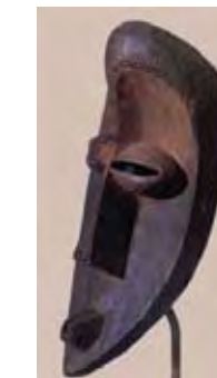
Mask Mahongwe Republic of Congo Museum Modern Art New York