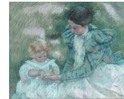
Mary Cassatt Mother Playing with Child, 1897 Pastel on woven paper, mounted on cardboard Metropolitan Museum of Art New York

Look at the Mother and Child paintings below by Pablo Picasso and Mary Cassatt. How are these paintings similar to Lam's Mother and Child painting? How are they different?