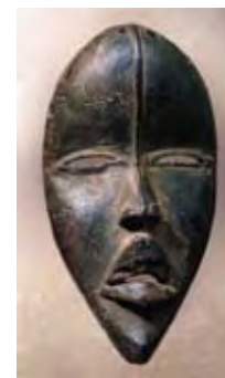
Mask Dan Ivory Coast Museum Reitberg Zurich