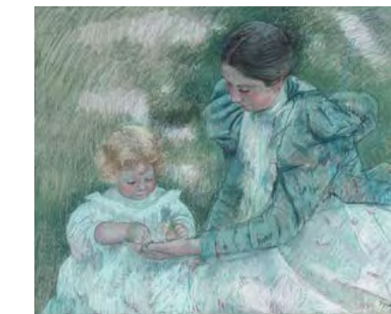
Mary Cassatt Mother Playing with Child, 1897 Pastel on woven paper, mounted on cardboard Metropolitan Museum of Art New York

Look at the Mother and Child paintings below by Pablo Picasso and Mary Cassatt. How are these paintings similar to Lam's Mother and Child painting? How are they different?