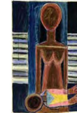
Wifredo Lam Mother and Child, 1939 Oil on canvas Museum of Modern Art New York