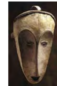
Mask Fang Gabon Musée du quai Branly Paris

DO YOU SEE THESE MASKS USED AS FACIAL FEATURES IN PAINTINGS BY WIFREDO LAM?