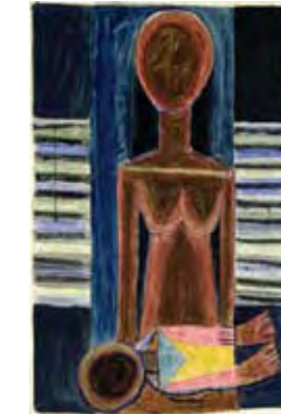
Wifredo Lam Mother and Child, 1939 Oil on canvas Museum of Modern Art New York