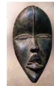
Mask Dan Ivory Coast Museum Reitberg Zurich