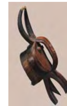
Mask Baule Ivory Coast Musée Picasso Paris