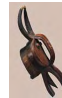
Mask Baule Ivory Coast Musée Picasso Paris