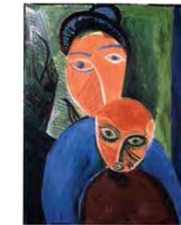
Pablo Picasso Mother and Child, 1907 Oil on canvas Musée Picasso Paris

"African artists had been sculpting masks as early as Paleolithic times, continuing to do so through the Kingdoms of the Dogon, the Baule, the Basongye and the Dan. The masks were typically used as stand-ins for the gods, deities or spirits of ancestors." [Lowrey Stokes Sims]