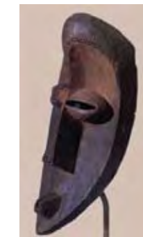
Mask Mahongwe Republic of Congo Museum Modern Art New York