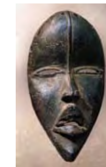
Mask Dan Ivory Coast Museum Reitberg Zurich