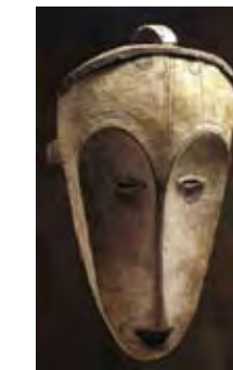
Mask Fang Gabon Musée du quai Branly Paris

DO YOU SEE THESE MASKS USED AS FACIAL FEATURES IN PAINTINGS BY WIFREDO LAM?