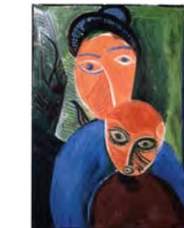
Pablo Picasso Mother and Child, 1907 Oil on canvas Musée Picasso Paris

"African artists had been sculpting masks as early as Paleolithic times, continuing to do so through the Kingdoms of the Dogon, the Baule, the Basongye and the Dan. The masks were typically used as stand-ins for the gods, deities or spirits of ancestors." [Lowrey Stokes Sims]