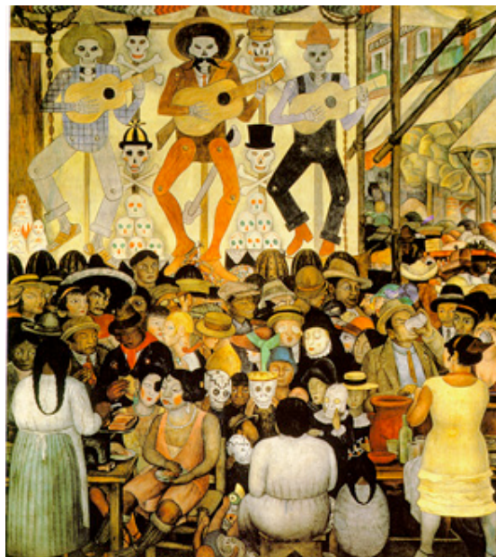
Day of the Dead Painting by Diego Rivera Ministry of Public Education, Mexico City