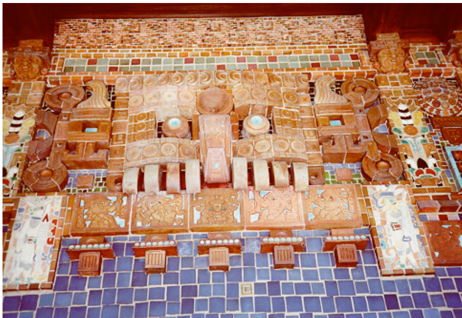
Contemporary mural Organization of American States Photograph Linda Krefl 2000

Context-There are a number of muralists that work in Milwaukee.