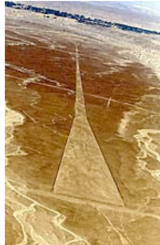
Nasca Lines Nasca River Valley, Peru

One of the most respected ideas about the origin and meaning of the Nasca lines is offered by Maria Reiche, who has devoted herself to the study of these lines. Reiche hypothesized that the lines served a religious and social function, and that they were iconography intended as reminders to the gods, to insure that the needs of the Nasca people were not forgotten. For example, there is a drawing in the desert for the Big Dipper and the symbol for rain. Reiche speculates that this drawing was created during a drought to alert the gods that the Nasca people needed rain.