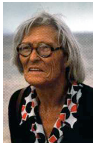
Maria Reiche Nasca River Valley, Peru